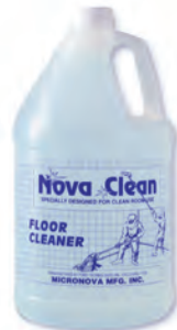
NovaClean® Concentrated multi surface detergent NC1-G

The large polyester SlimLine™ Slip Cover is designed for single use or can be layered with multiple slip covers. When cleaning larger areas the layering technique minimizes time taken to change mops. Smaller sizes are available for walls, equipment, and smaller areas.