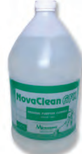
NovaClean® AFX Amine free formulation NC10-G