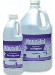
NovaHol® Ready to Use quick drying formula with IPA NH1-G, NH1-Q