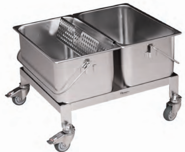
C-92 cart includes two B-99 buckets. Shown with W-92 Wringer

Available with 6-gallon molded polypropylene or 8-gallon molded stainless steel buckets. Stainless Steel system includes brake feature.