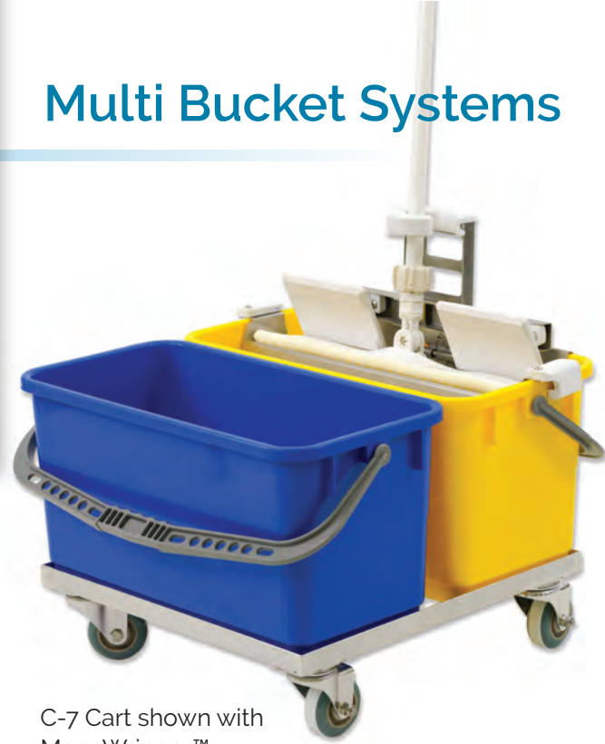
C-7 Cart shown with MegaWringer™