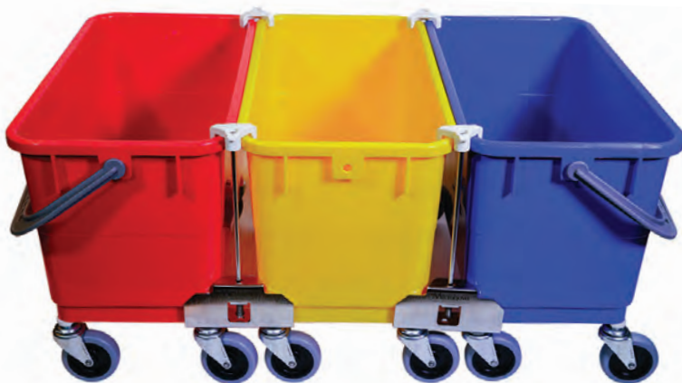
The kit includes two or three polypropylene buckets with casters and one or two sets of BucketBinders (bucket connectors).